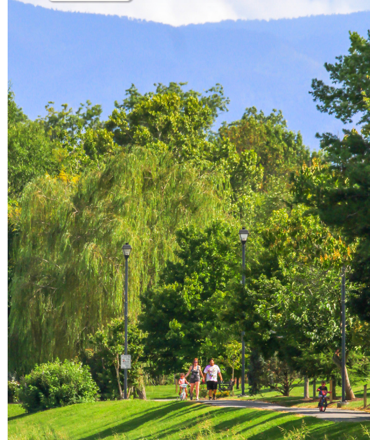
10 Miles Of Developed Greenways & Walking Trails Free Parking At Trailheads Loved By Locals & Visitors Alike

Sevierville, Tennessee “Your Hometown in the Smokies” SEVIERVILLETN.ORG