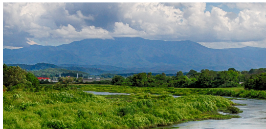
10 Miles Of Developed Greenways & Walking Trails