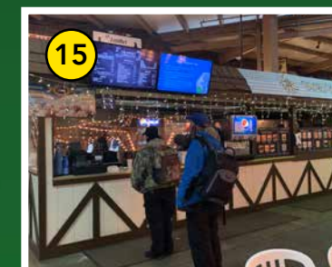
The Market Deli