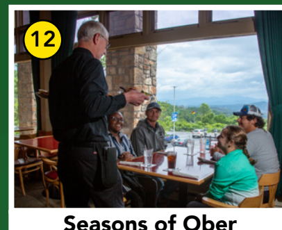
Seasons of Ober Restaurant