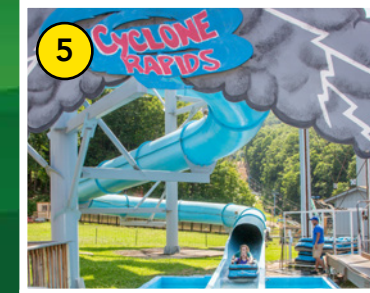
Blue Cyclone Rapids