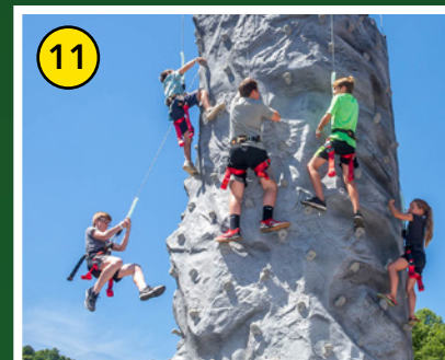
Rock Climbing Wall