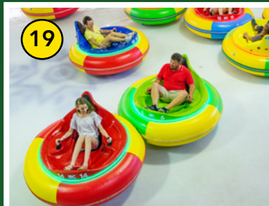
Ice Bumper Cars