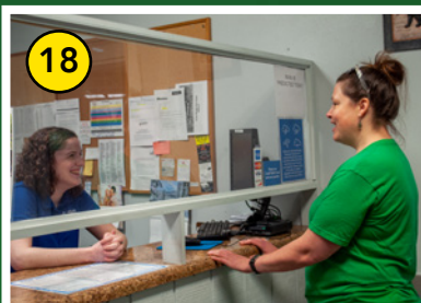
Guest Services Visit if you need help with issues related to tickets purchased.