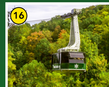
Tramway Loading Dock