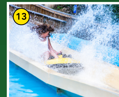
Water Raft Rides