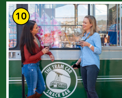
Tram Car Snack Bar