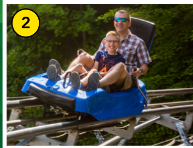
Ski Mountain Coaster